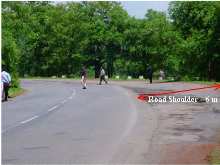
A close up photograph showing the Road shoulder.