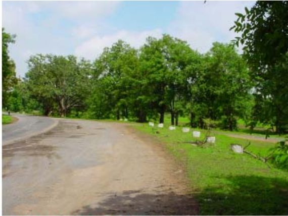
Close up photograph of the hard shoulder...