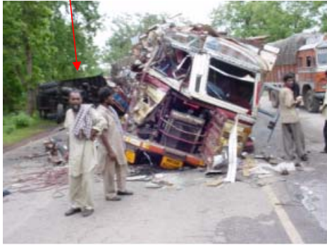
Accident photo (5113 facing us) & 4410 at the back