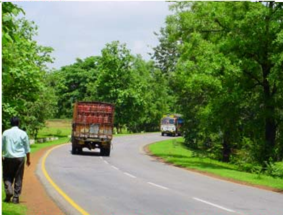
Trucks crossing center line - Driving behavior at the site. (crossing center line)