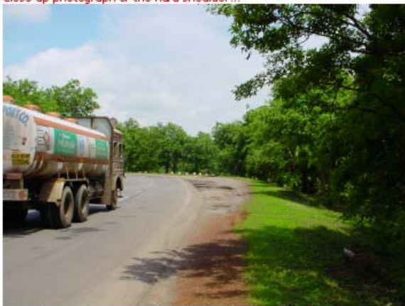
A truck pictured as it approaches left hand curve. Typical behavior (crossing center line) - Observed at site